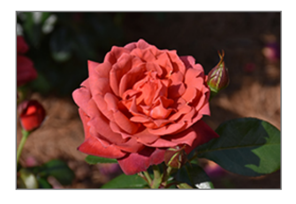
Hot Cocoa Rose flowers