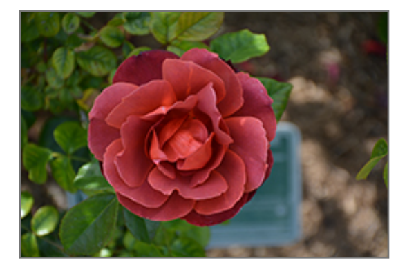
Hot Cocoa Rose flowers