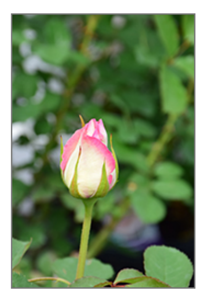
Moonstone Rose flower buds

This shrub will require occasional maintenance and upkeep, and is best pruned in late winter once the threat of extreme cold has passed. It is a good choice for attracting bees to your yard. It has no significant negative characteristics.