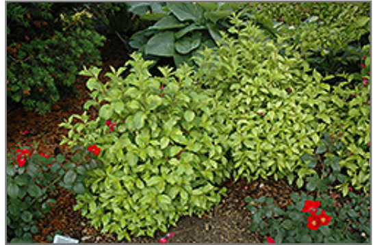
Ghost Weigela

This shrub should only be grown in full sunlight. It prefers to grow in average to moist conditions, and shouldn't be allowed to dry out. It is not particular as to soil type or pH. It is highly tolerant of urban pollution and will even thrive in inner city environments. This is a selected variety of a species not originally from North America.